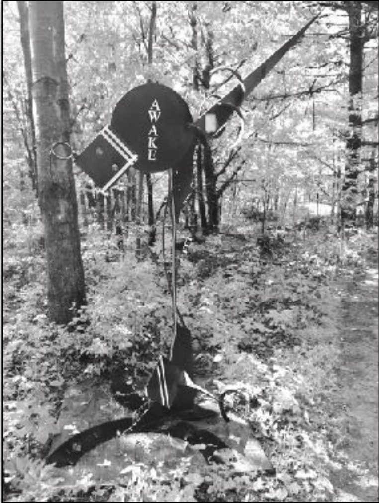
Homage to JFK Sculpture by The C Lyon 94" X 41" X 53" 1988